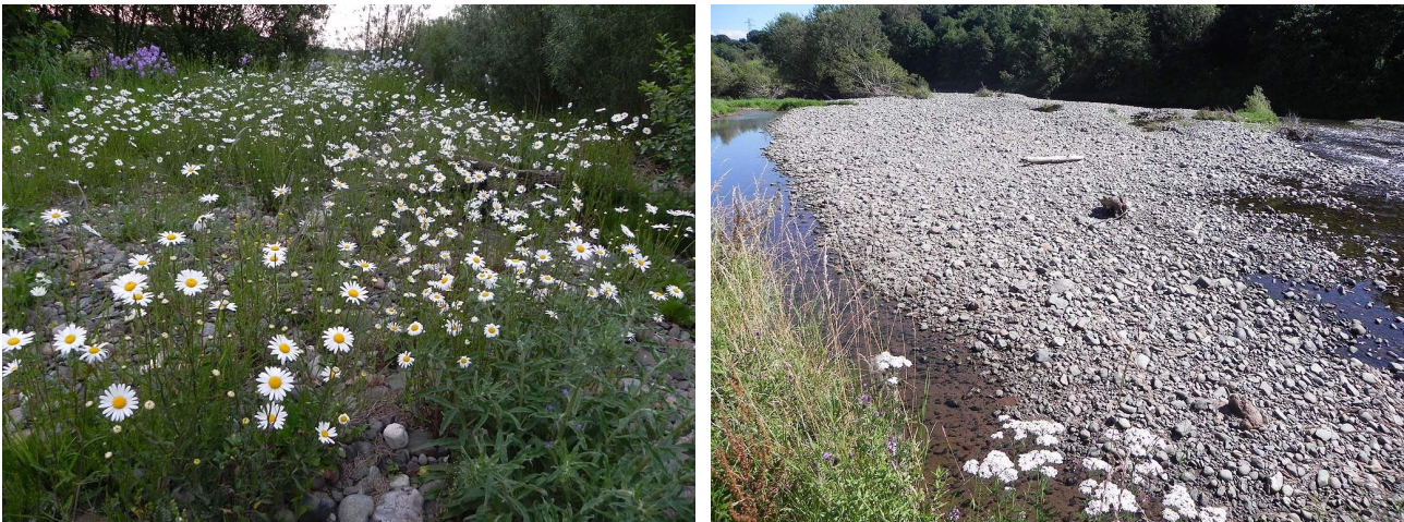
Shingle beds before and after June 2012 flood