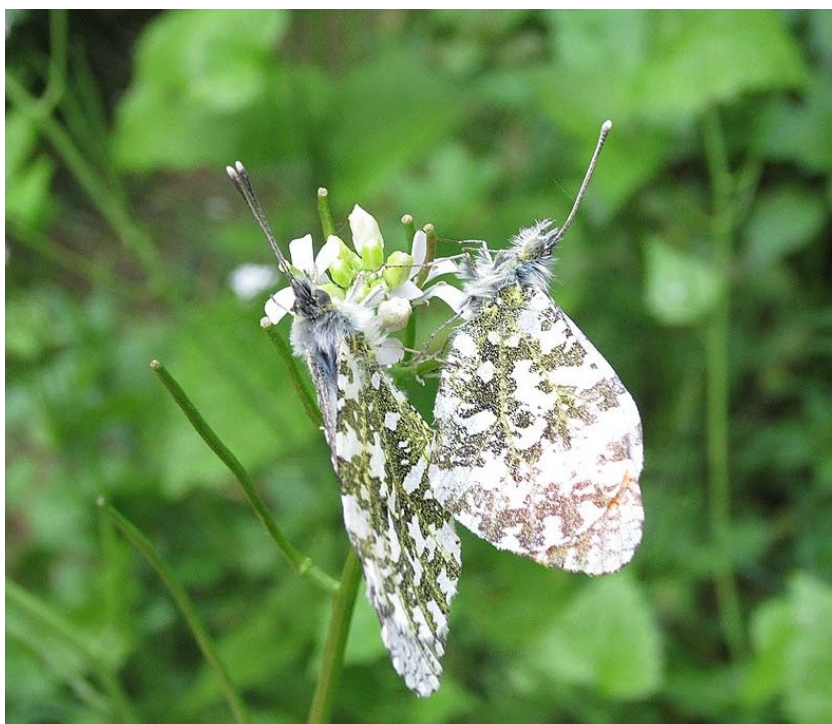
Orange-tip butterfly: mating pair

The Orange-tip (below: mating pair) and the ‘white’ butterflies (especially the Green-veined White) rely on various ‘crucifers’ such as Garlic Mustard ( Alliaria petiolata ), Cuckoo-flower ( Cardamine pratensis ), Hedge Mustard ( Sisymbrium officinale ), Charlock ( Sinapis arvensis ), and Dame’s Violet ( Hesperis matronalis ).